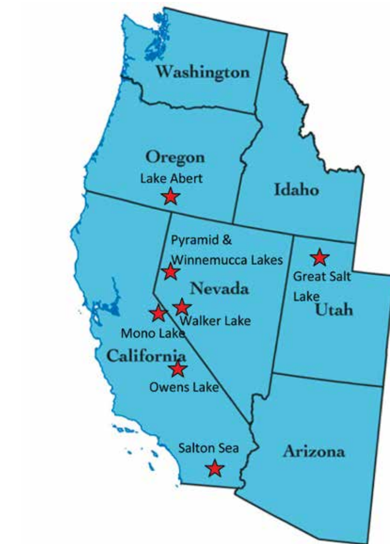
Figure 1. Terminal lakes in the western United States described in this issue.

There are successful templates, such as Pyramid and Mono lakes to serve as guides for how these lakes can be saved or restored. The key involves local effort to bring the problem to the attention of