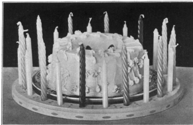
HICKORY NUT CAKE HAND PAINTED RING TO HOLD BIRTHDAY CANDLES

This version of the cake maintained the special quality but lacks the elegance of the earlier cake served on a silver platter. It brings the Birthday Cake into the realm of the middleclass family. The hand painted candleholder ring is a simple wooden ring with simple/plain painted dots and ovals. It is an inexpensive mass produced product. In reality it was an upgraded version of the 1899 homemade paste-board frame to hold the candles placed around the top edge of cake. (p.776)