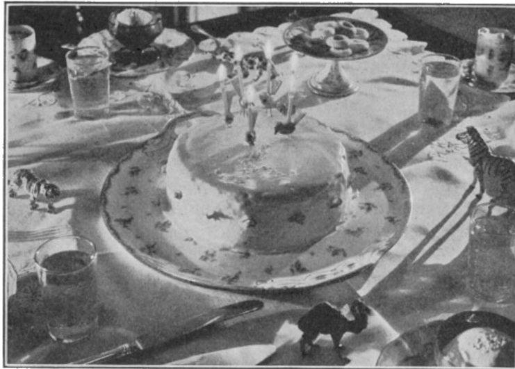
Cream Sponge for a Birthday with Bright Wooden Birds Feeding on Tiny Candy "Seeds"

no longer a candle ring it was replaced by small brightly colored wooden birds arranged like a small flock of birds feeding on seeds on the ground. It was cute for a child's birthday decoration. ( Boston Cooking School Cook Book 1936, 652)