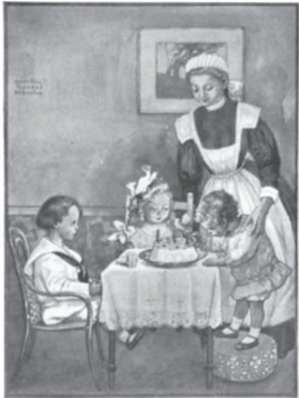
Birthday Party from St. Nicholas (1909)

She explained a large cake was to be baked in the "dripping pan and heavily frosted." When the frosting was partially dried "mark it off in small squares and put half an English walnut meat on each." The next step was to cut a narrow "paste-board" [cardboard] frame to go around the edge. Small holes were cut in the paste-board to hold the candles. To dress up the frame, fancy colored paper was added. Then she explained how it was to be served. "The lights in the room should be put out and the cake brought in with candles lit and placed before the person whose natal day is being celebrated and he should cut and distribute it." (p.462)