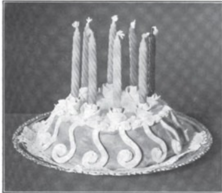
Decorated cake with piped frosting & rosebud candle holders served on a silver platter. Boston Cooking School Magazine (Mar 1906)

The sponge cake became the favored child's birthday cake. This separated it from the butter based fruit cake which also became a favored cake for use as a birthday cake presumably for adults.