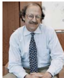
Nobelist Harold Varmus

Nuclear fission was a mere eight months old when the Panzers rolled into Poland in September 1939, beginning the Second World War. Niels Bohr had announced the discovery at a conference on theoretical physics at George Washington University. Three years later the crash program to build an atomic device from a uranium isotope began in earnest. And within three years of that—Aug. 6, 1945—a bomb named Little Boy exploded over Hiroshima.