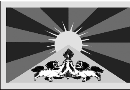
Fig. 1: Flag of the Tibetan Government in Exile

AOKI BUNKYŌ was the Japanese priest who in 1902 designed the Snow Lion flag with a Rising Sun background, which is still used by the Tibetan exile movement. (See Figs. 1 and 2) He also translated Meiji Army field manuals into the Tibetan language. Aoki reemerged three decades later as chief Tibet expert in the wartime Foreign Ministry.