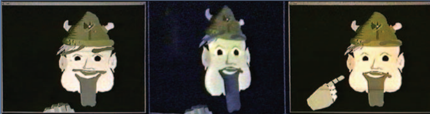
Figure 2b: Gandalf is "massively interactive," reacting believably to anything from the user's subtle eye movements (e.g. a glance over to the solar system), to a full communicative act such as questions about the planets.

explicit representation of each module's contextual behavior, and carry with it their state, so the blackboard provides a localized recording of all system events and system flow. Messages effectively implement APIs between the system's modules, specifying their interactions at the content level, through a unified protocol. Combined with blackboards, a publish-subscribe architecture is thus a powerful tool for incremental building and debugging of interactive systems. We take advantage of this fact with a web-based system inspector, which can display the state of modules while Psyclone is running. This facility has turned out to be invaluable for debugging, since the path of decisions, embodied in the message flow, can be inspected directly. Also, this tool works from a remote location, which can be very useful on systems where the machines are geographically disparate. The architecture of Psyclone is shown in Figure 3.