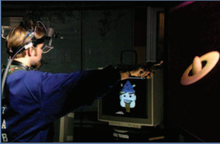
Figure 2a: The Gandalf character interacting with a user, who is asking Gandalf to tell him about the planet Saturn. Gandalf's rich multimodal perception and multimodal output enables him to generate dialog behavior akin to that observed between two people. A special body-tracking system, including gloves, jacket and eye tracker, provide Gandalf with enough fine-grain perception to allow highly reactive behavior, in addition to deliberative actions.