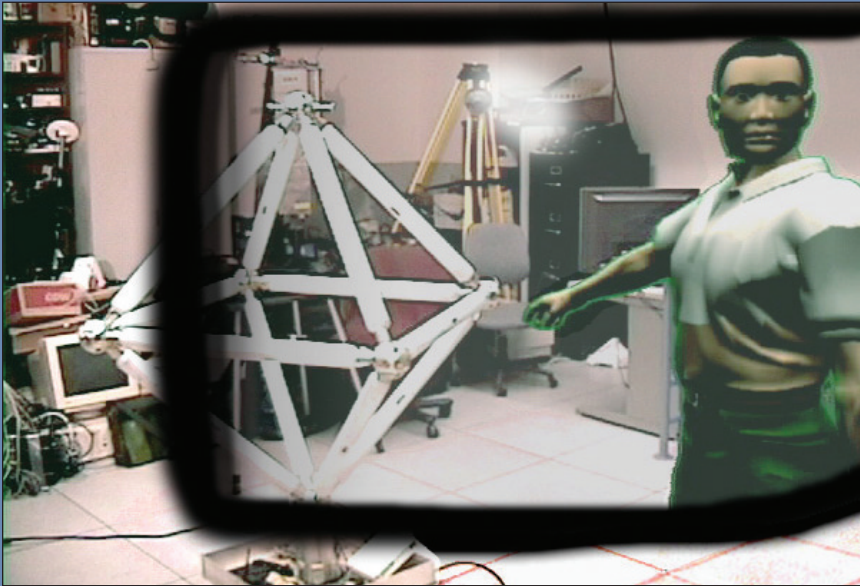
Figure 4: Mirage, seen through the LCD screen of the "magic glasses" that reveals the agent to the user. (Image has been digitally enhanced for clarity.)

important as more third-party modules become available and manual maintenance of semantics becomes impractical. Other planned enhancements include extending Psyclone to support a large number of modules (thousands or tens of thousands in mixed configurations, including single/multiple modules per executable), running on a large number of computers.