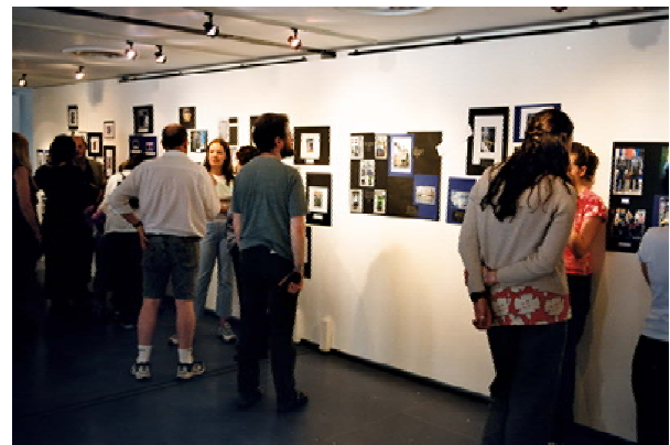
Figure 3: Opening of public gallery exhibition at the end of the first week of workshops

The workshop structure was intended to be as fluid and dynamic as possible as children worked to prepare final exhibits for a gallery space and the Internet.