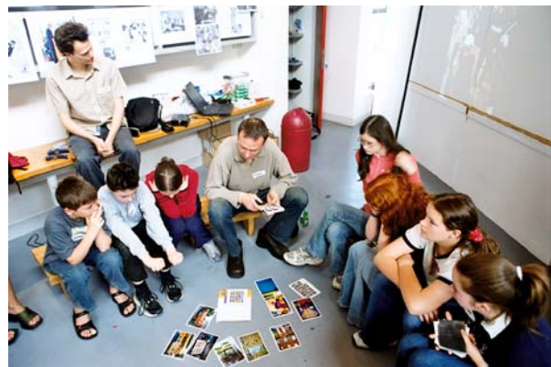
Figure 6: A group critique of participants' images.

Throughout the workshop, the issue of trust arose in different ways. The photojournalism professionals emphasized that their reputations as respected and professional communicators relies on a sensitive and ever-developing relationships with editors, publishers and the general public. Their images are their principal means of both communicating stories and preserving this trust. If they were to routinely manipulate photos or adopt obviously biased stances, their credibility with their employers and audiences would be damaged. The photojournalists wanted to emphasize this with the young adult participants and were originally uncomfortable with the extent to which the children were manipulating images, especially with digital tools.