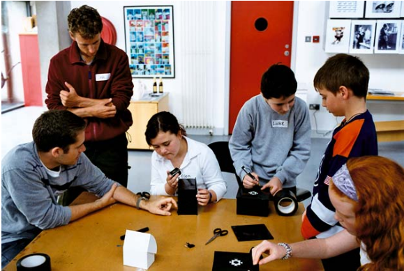
Figure 4: Building pinhole cameras

Wednesday: group critique of Tuesday's assignment images; continued review of professional photojournalism portfolios; scoped and planned own photojournalism assignments; fieldwork with 35mm cameras to interpret and shoot self-designed photojournalism assignments.