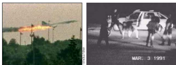
Figure 1: Two examples of one form of public media display: the 2000 Paris Concorde crash and the 1991 Rodney King beating where amateur video was bought and used by mainstream media. Our goal in Citizen Journalism is to create mechanisms for more continuous, personally crafted and arguably less sensational, more lasting participation in different broadcast media.

Our goal is to create an environment in which citizens and photojournalists can engage in professionally situated, apprenticeship-like learning relationships that result in online “communities of practice” [10, 14]. The learning environment is not a formal pedagogical space but an informal environment where individuals of different ages, socio-cultural backgrounds and technical expertise collaborate to create and critique personally meaningful images. We also work in Papert’s [12] tradition of constructionist learning environments in which participants learn about themselves, others and abstract concepts by creating and manipulating concrete “objects to think with.”