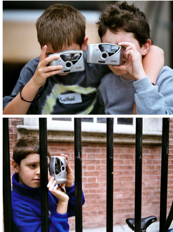
Figure 7: Different shooting styles of different participants emerged throughout the week

These style differences extended to the preparations of exhibits. Some participants carefully crafted each edit, caption and image arrangements. Others edited their images little instead seeming to prefer to explain verbally why individual pictures did or did not suit a particular theme.