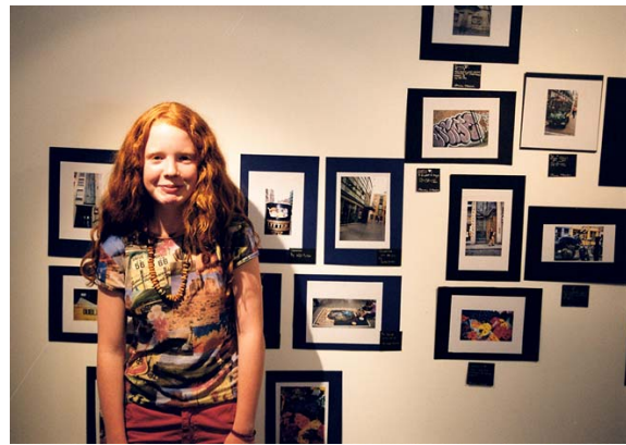
Figure 5: Opening of public gallery exhibition at the end of the first week of workshops

During group critiques, individual conversations and while preparing and presenting exhibits, participants tended to describe not only the content of images but other information not directly represented in the photos ( e.g. what had happened before or after the image was taken; whether the image addressed the assigned or self-designed theme; something one of the people in the picture had said; how a particular picture was not exactly what they had really wanted from a particular scene). In thinking about how to present her images, one participant remarked that "really, to tell the whole story, I need to be with the picture or make sure it was with other pictures that were my theme, too." Participants seemed to be expressing both pride and frustration in the different methods of exhibiting images.