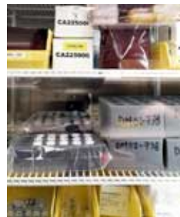
Experimental cancer meds

Flawed models for drug development. Obsession with tumor shrinkage. Focus on individual cellular mechanisms to the near exclusion of what's happening in the organism as a whole. All these failures come to a head in the clinical trial—a rigidly controlled, three-phase system for testing new drugs and other medical procedures in humans. The process remains the only way to get from research to drug approval—and yet it is hard to find anyone in the cancer community who isn't maddeningly frustrated by it.