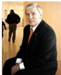
Three-time survivor and NCI chief Andy von Eschenbach

There has been talk like this before. But the money to fund the assault never came. And several cancer experts interviewed for this story worry that the new rhetoric from the NCI, while encouraging, has yet to move beyond lip service.