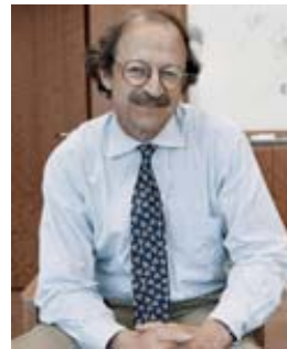
Nobelist Harold Varmus

Nuclear fission was a mere eight months old when the Panzers rolled into Poland in September 1939, beginning the Second World War. Niels Bohr had announced the discovery at a conference on theoretical physics at George Washington University. Three years later the crash program to build an atomic device from a uranium isotope began in earnest. And within three years of that—Aug. 6, 1945—a bomb named Little Boy exploded over Hiroshima.