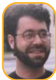
By Philip Crawford

Perhaps the most powerful way of encouraging children to read is by exposing them to light reading, a kind of reading that