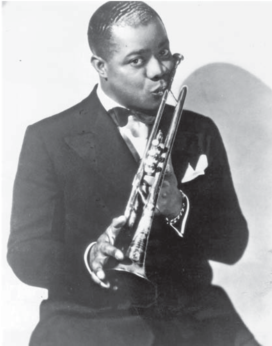
Louis Armstrong was one of many talented African-American blues and jazz artists who descended on New York City during the Renaissance era.

South prior to the Civil War. Blues songs developed from the sorrow-filled laments that were sung by slaves on plantations all across the South. “Rag-time”—music played in syncopated or ragged time—evolved from the call-and-response patterns of slave work songs. Jazz music, meanwhile, took elements of both blues and ragtime and joined them with traditional black spirituals and an emphasis on musical improvisation.