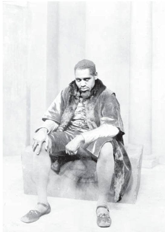
Paul Robeson, seen here in a London production of Othello , was one of the greatest stars of the stage in the 1920s and 1930s.

Other milestones in serious black theater during the 1920s included the 1923 Broadway debut of The Chip Woman's Fortune , a drama by black playwright Willis Richardson that was performed by the National Ethiopian Art Players; the 1925 drama Appearances by Garland Anderson; Paul Green's Pulitzer Prize-winning drama In Abraham's Bosom , which debuted in 1927 with an all-black cast including Jules Bledsoe and Rose McClendon; and the 1929 Broadway hit Harlem , which was co-written by the fiery black writer Wallace Thurman and white playwright William Jourdan Rapp. In addition, important black acting troupes and organizations such as the Negro Experimental Theatre, the Negro Art Theatre, and the National Colored Players all were founded in the 1920s.