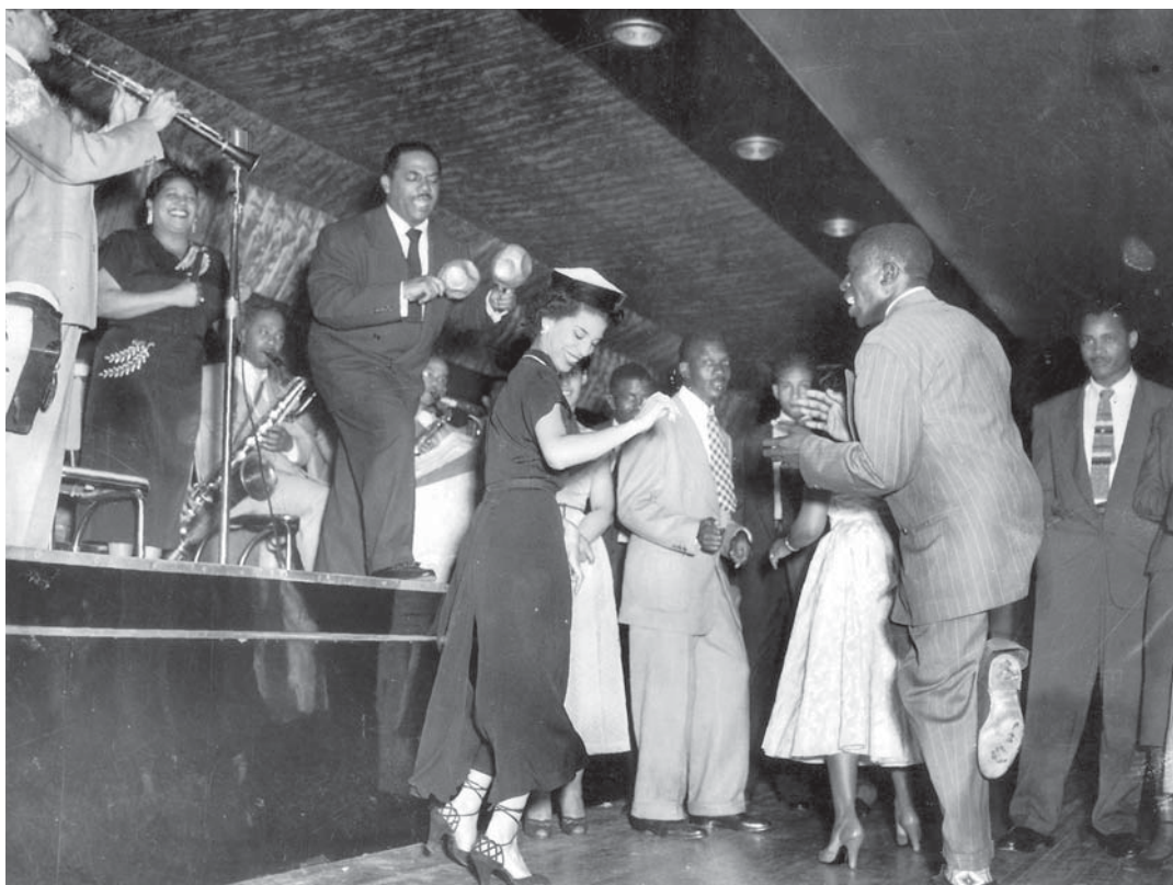
The Savoy Ballroom was one of the jewels of the Harlem nightclub scene during the Renaissance era.

The existence of the segregationist Cotton Club within America's most famous black neighborhood angered and frustrated many Harlem residents. The cabaret survived for only a few short years, though. One year after the Harlem riots of 1935, the Cotton Club moved to a new downtown location. Few Harlem residents were sorry to see it go. Four years later, it closed its doors forever.