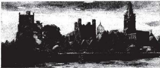
CHRIST CHURCH COLLEGE, OXFORD