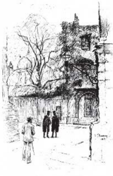
THE CORNER TURRET.

Yet when we think how narrow and how devious this path of Nature is, how dimly we can trace it, for all our lamps of science, and how from the darkness which girds it round great and terrible possibilities loom ever