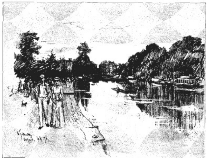
"THE TOW-PATH ALONG BY THE RIVER."

When Hastie, bearing his anatomical plunder, had clattered off down the winding stair, Abercrombie Smith hurled his pipe into the wastepaper basket, and drawing his chair nearer to the lamp, plunged into a formidable green-covered volume, adorned with great colored maps of that strange internal kingdom of which we are the hapless and helpless monarchs. Though a freshman at Oxford, the student was not so in medicine, for he had worked for four years at Glasgow and at Berlin, and this coming examination would place him finally as a member of his profession. With his firm mouth, broad forehead, and clear-cut, somewhat hard-featured face, he was a man who, if he had no brilliant talent, was yet so dogged, so patient, and so strong that he might in the end overtop a more showy genius. A man who can hold his own among Scotchmen and North Germans is not a man to be easily set back. Smith had left a name at Glasgow and at Berlin, and he was bent now upon doing as much at Oxford, if hard work and devotion could accomplish it.