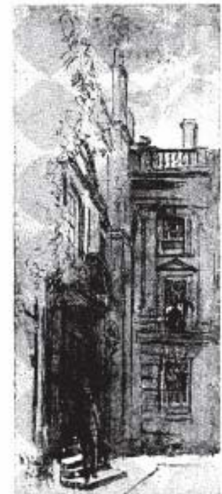
"HE SAW HIS NEIGHBOR'S HEAD AT THE WINDOW OUTLINED AGAINST THE LAMP-LIGHT."

A good walk and a friendly chat would be welcome to his jangled nerves.