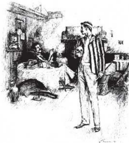
"GOOD-BYE, MY SON, AND TAKE MY TIP AS TO YOUR NEIGHBOUR."

"Not I. I'm supposed to be in training. Here I've been sitting gossiping when I ought to have been safely tucked up. I'll borrow your skull, if